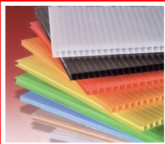
PP CORRUGATED SHEET