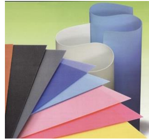
PP SOLID SHEET