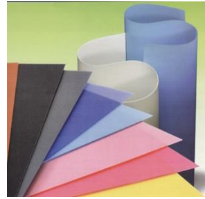
PP SOLID SHEET