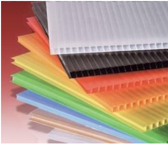
PP CORRUGATED SHEET